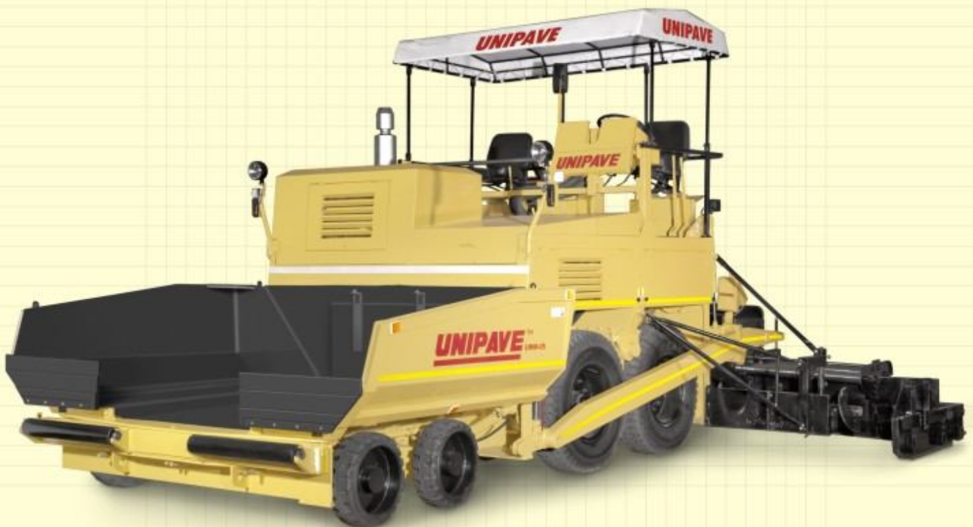
Paver Machine with double operator seat and sliding operating panel